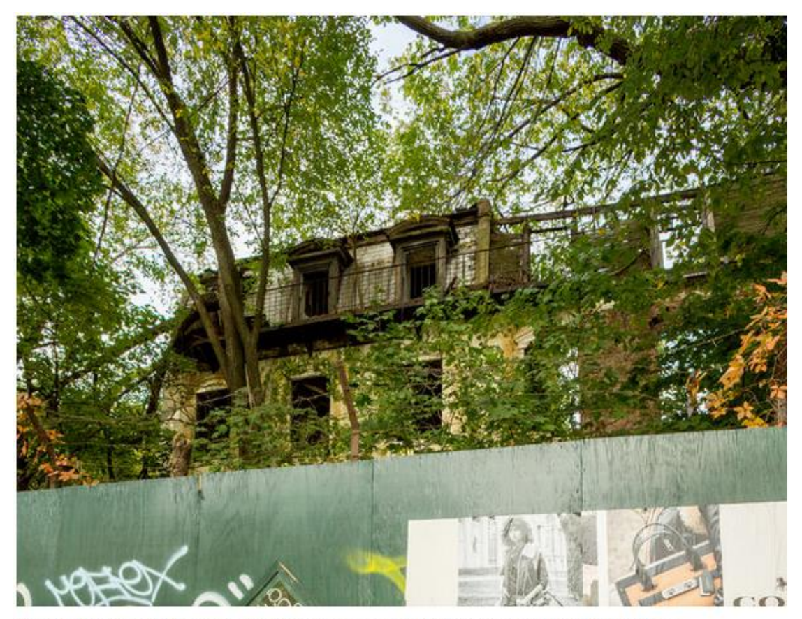
Most of the decrepit houses along Admiral's Row will be razed to make way for a supermarket.