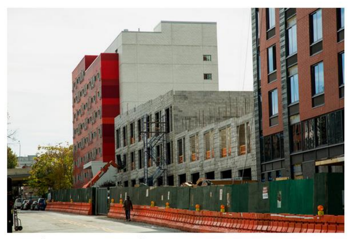
Construction at the Navy Green housing complex.

As of late October, six of the 10 houses put up for sale in June were in contract, a project spokeswoman said. A three-bedroom was listed last month at $1.995 million, or $689 a square foot.