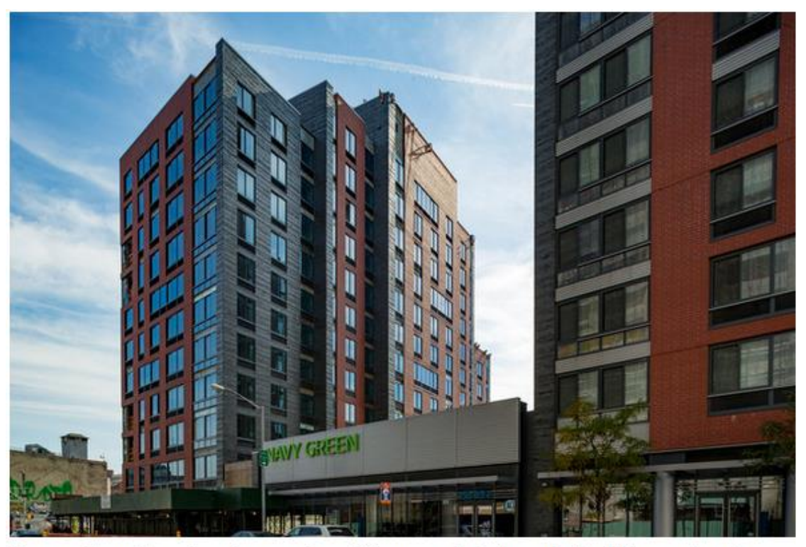
The new Navy Green housing complex will have market-rate and affordable apartments.

Meanwhile, the Brooklyn Navy Yard Development Corporation, the nonprofit entity that manages the city-owned facility, is removing some of the walls that have isolated the Navy Yard from the community, while adding a supermarket, a food hall and a park that the public can use.